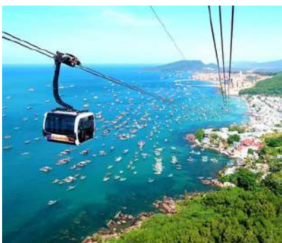
Pineapple Island Cable Car

Meals Breakfast at hotel Buffet Lunch on Pineapple Island Dinner at local Vietnamese Restaurant