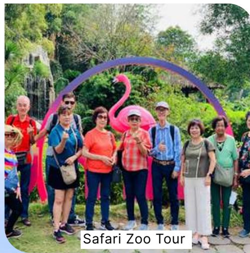
Safari Zoo Tour