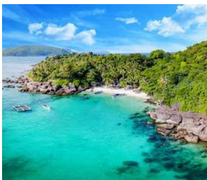
Gham Ghi Isle