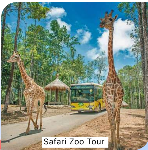
Safari Zoo Tour